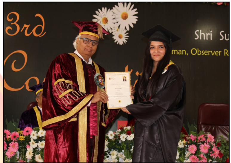
Sudheendra Kulkarni distributing the degrees